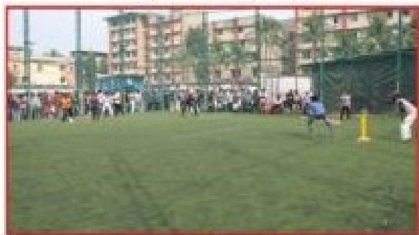
College Green Turf