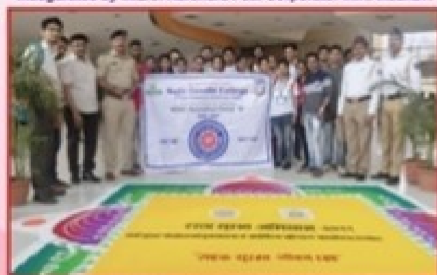
Road Safety Campaign with Navi Mumbai Police