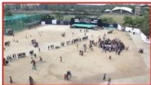
College Sports Ground