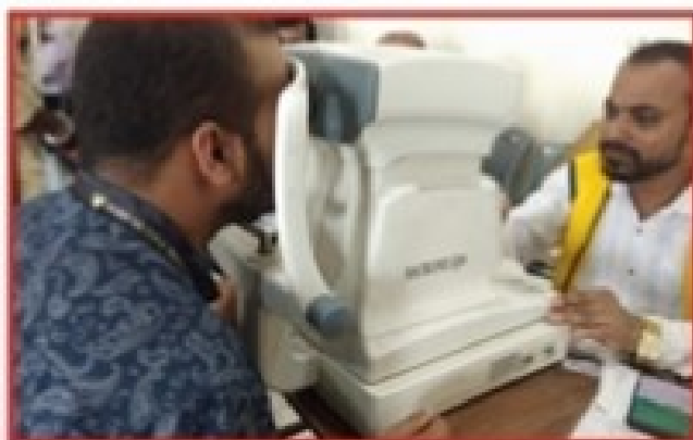
Eye - Check Up Camp