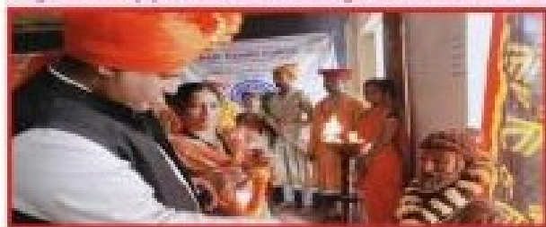
Celebration of Shri Maharaj Jayant