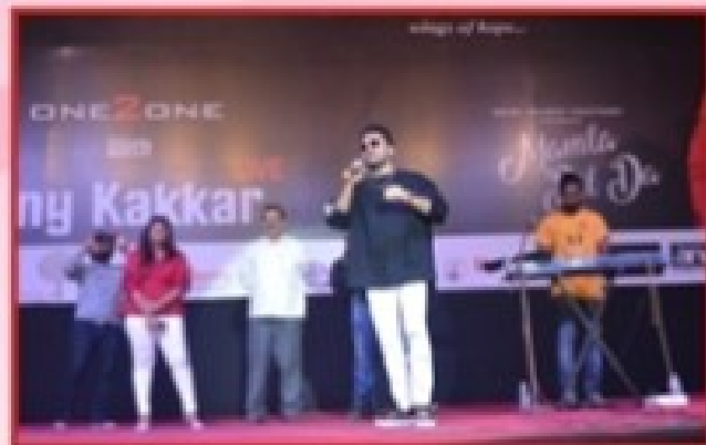
Music Composer & Singer Tony Kakkar Performing on Stage of "Prarambh 2K18"